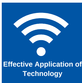
Effective Application of Technology